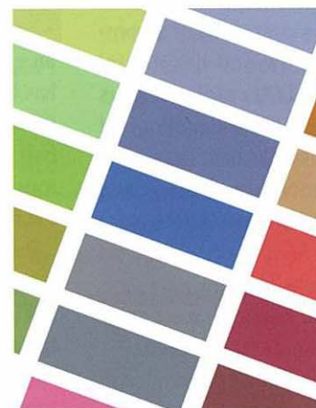
Discover the new colours!