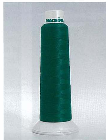
FROSTED MATT 40

We could list many more reasons; though those familiar with this thread already know its special features and whoever